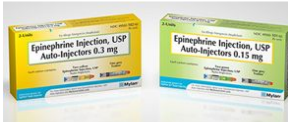
Generic Epinephrine USP auto-injector